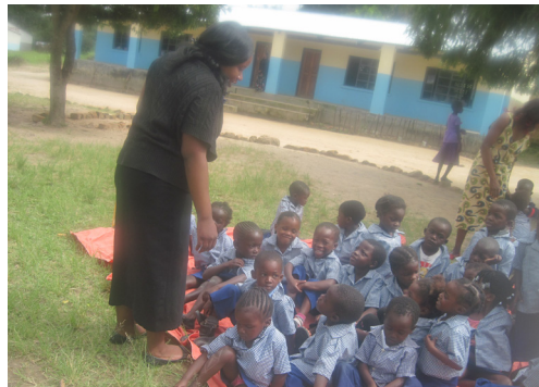
Pre-school class on the grass