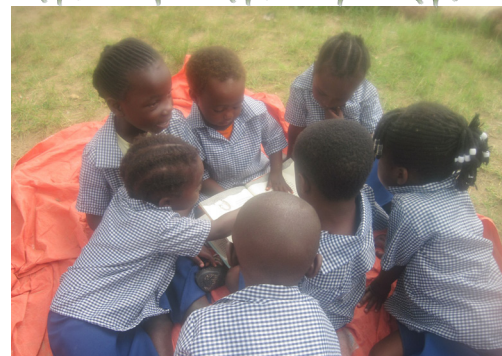
Pre-school children reading