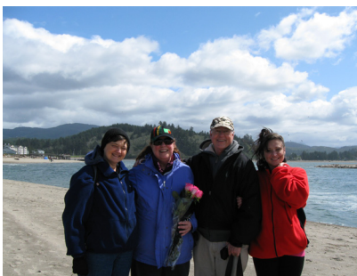
Family and friends at Siletz Bay