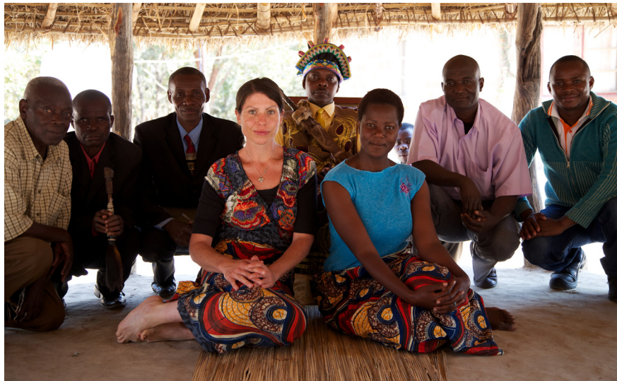
Village headmen visit High Chief Sai'lunga to accept land grant for the new Lumwana West secondary school (full story in December 2013 newsletter)