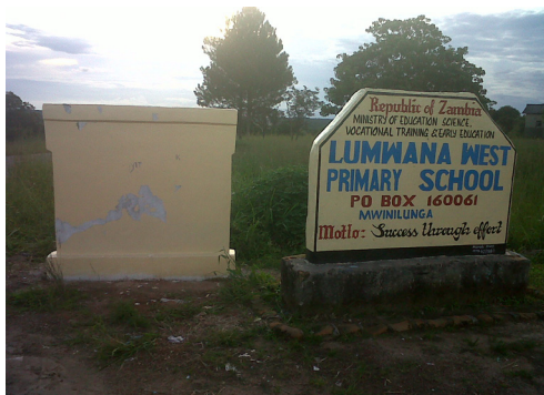
Waiting for a Secondary School sign