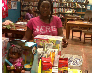
Preschool supplies from Schirle