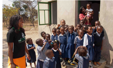
Thank you, Schirle Elementary!