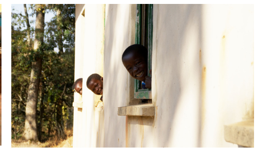
Eager preschoolers—We're ready to go!